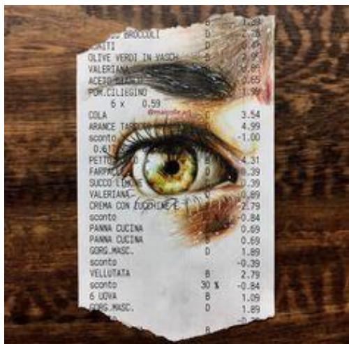
On a receipt