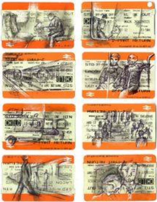
On train tickets