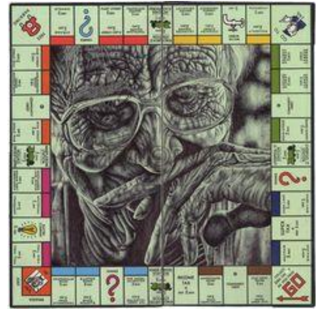
On a board game