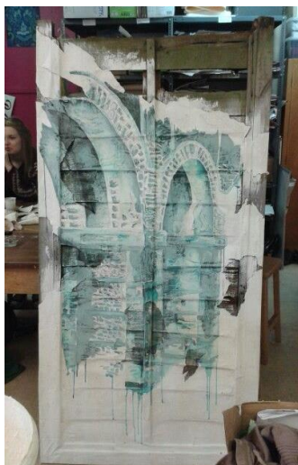
On old furniture