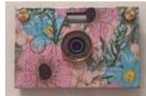
On an object