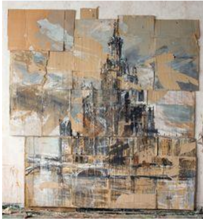
On old cardboard